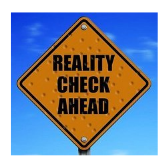
Craziest Lawsuit of the Month

Be one step ahead, keep following our newsletter for up to date changes in the law!